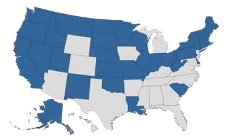
States with participating facilities and programs are shown in blue.

operations, programs and services. PbS was launched 20 years ago by the Office of Juvenile Justice and Delinquency Prevention (OJJDP), US Department of Justice, to address the safety, health and quality of life issues reported in the 1994 Conditions of Confinement Study. Over time, PbS uniquely has established national standards to guide operations and uniform performance outcome measures to continuously, accurately and comprehensively monitor daily practices and cultures within youth facilities.