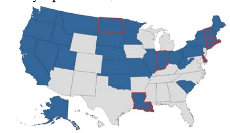
Blue states have participating facilities; states outlined in red have community residential programs

youths' daily experiences. PbS trains and supports participants to collect qualitative data – surveys of youths, staff and families - and quantitative administrative record and incident data and uses the information to implement reforms. Unlike other standards efforts, PbS focuses on using the information collected to promote best practices and on continually measuring facilities' safety, quality of life and services. PbS was a winner of the 2004 Innovations in American Government Award for uniquely and effectively addressing conditions of confinement.